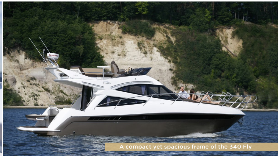
A compact yet spacious frame of the 340 Fly

Expert engineering and Galeon's years of experience have come together to produce a yacht designed to provide the greatest possible independence on all three decks. The exterior includes a foldout sofa in the cockpit, with a generous flybridge that holds a table, refrigerator, and comfortable tanning beds. Attractive, modern glass doors lead to the saloon. Behind the doors is a