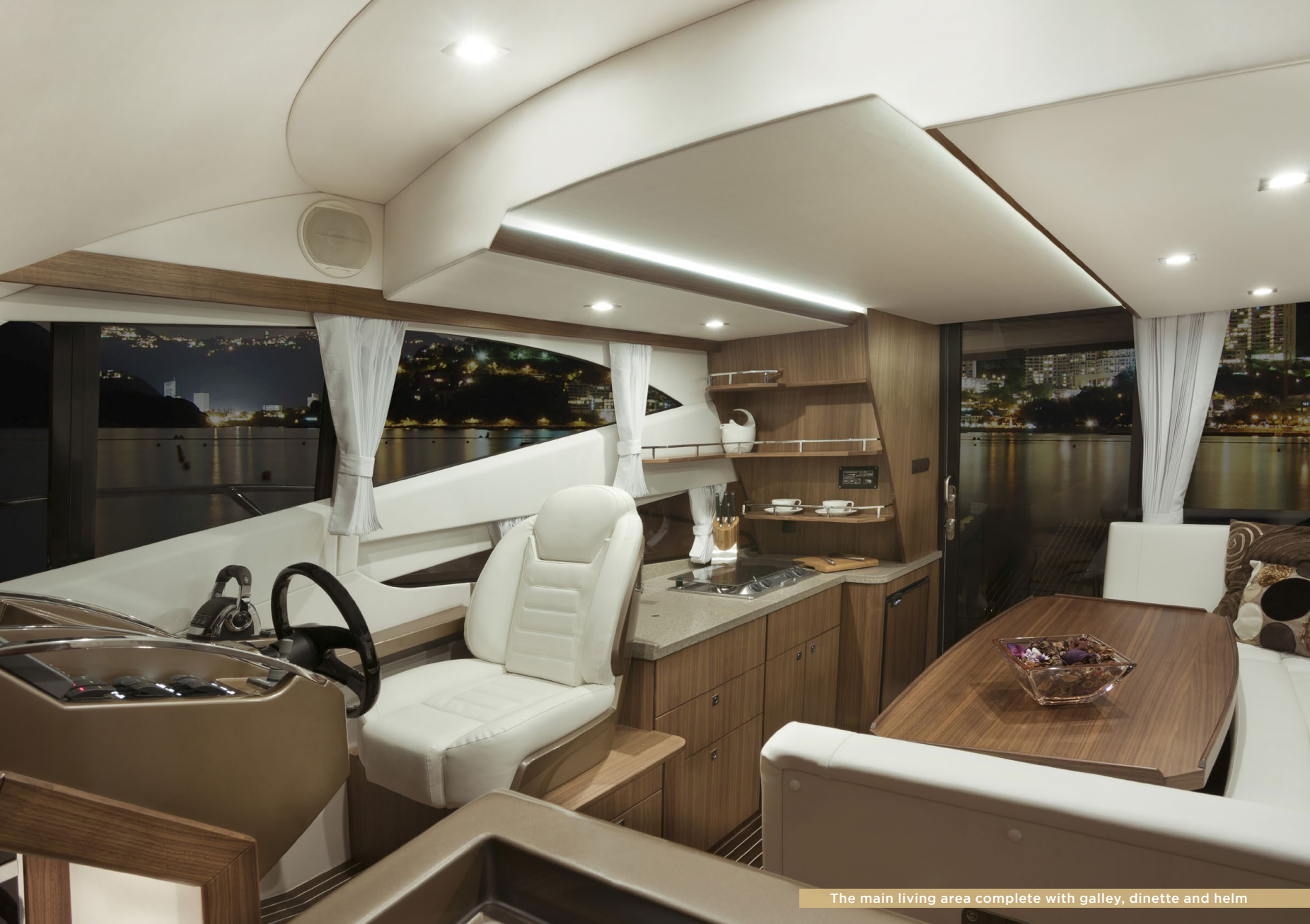
The main living area complete with galley, dinette and helm