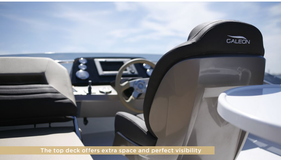
The top deck offers extra space and perfect visibility