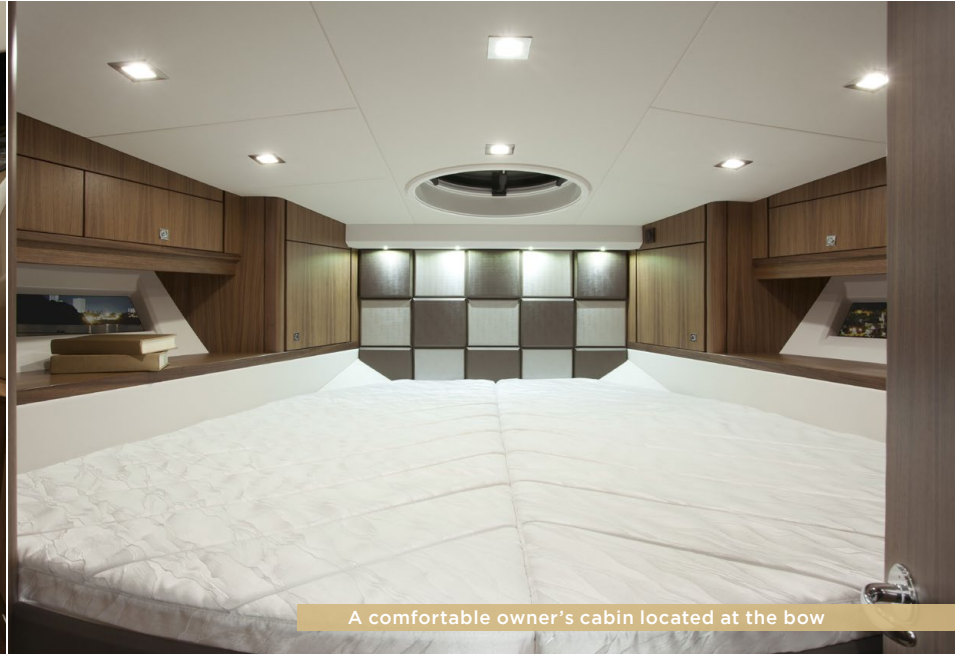
A comfortable owner's cabin located at the bow