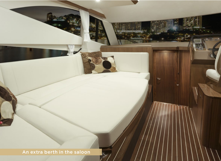
An extra berth in the saloon