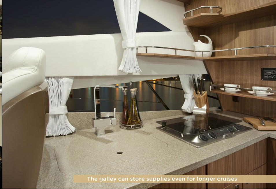
The galley can store supplies even for longer cruises