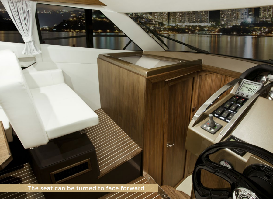
The seat can be turned to face forward