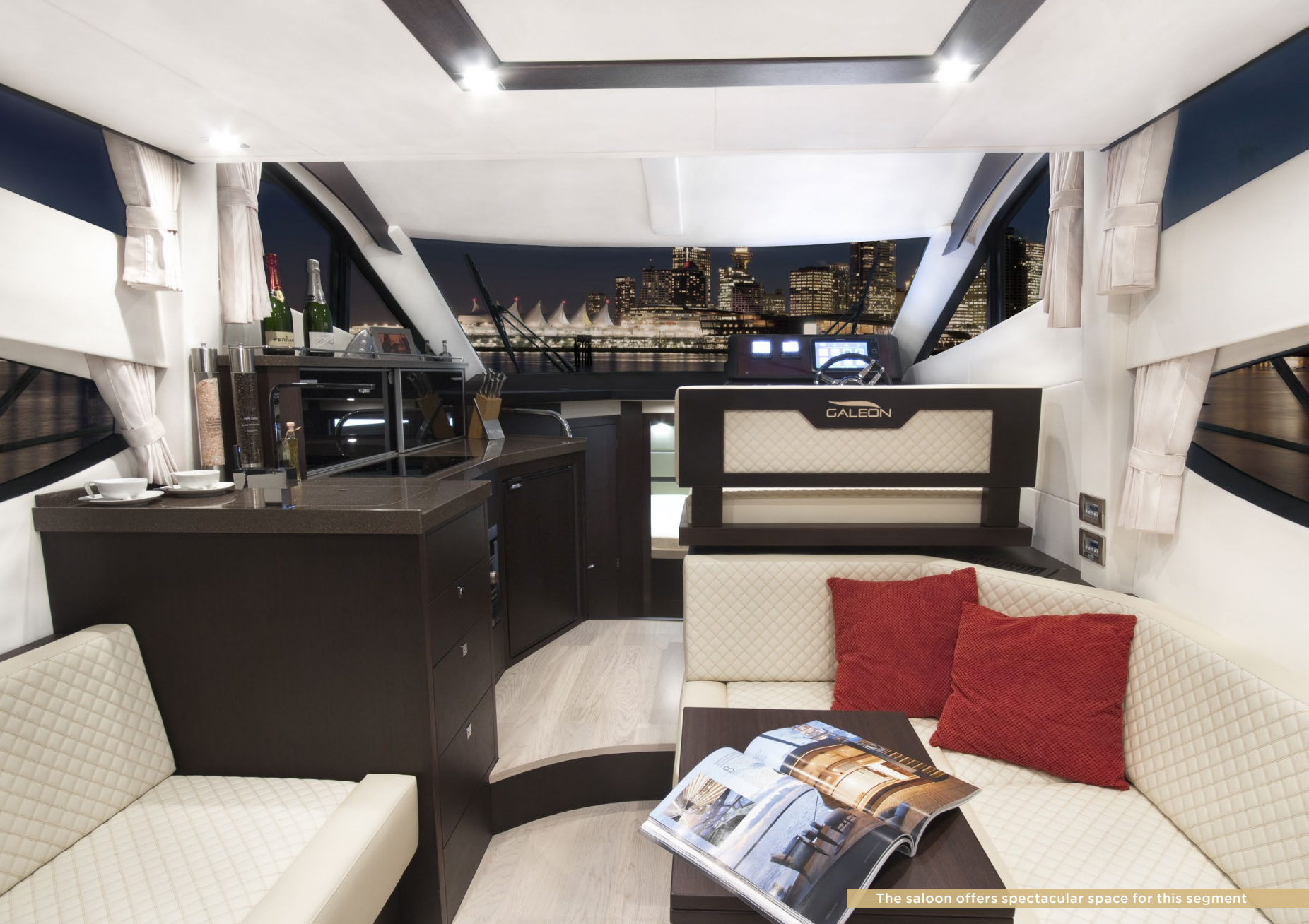
The saloon offers spectacular space for this segment