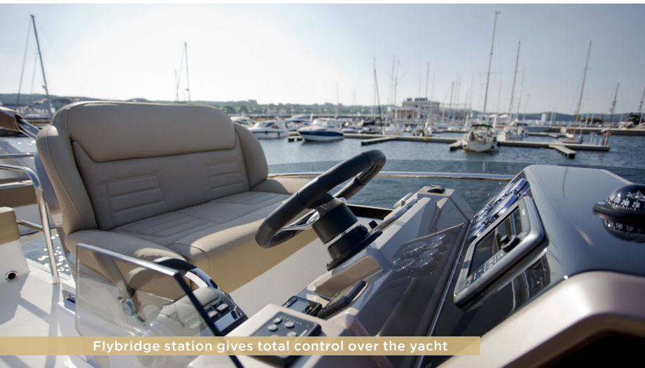
Flybridge station gives total control over the yacht