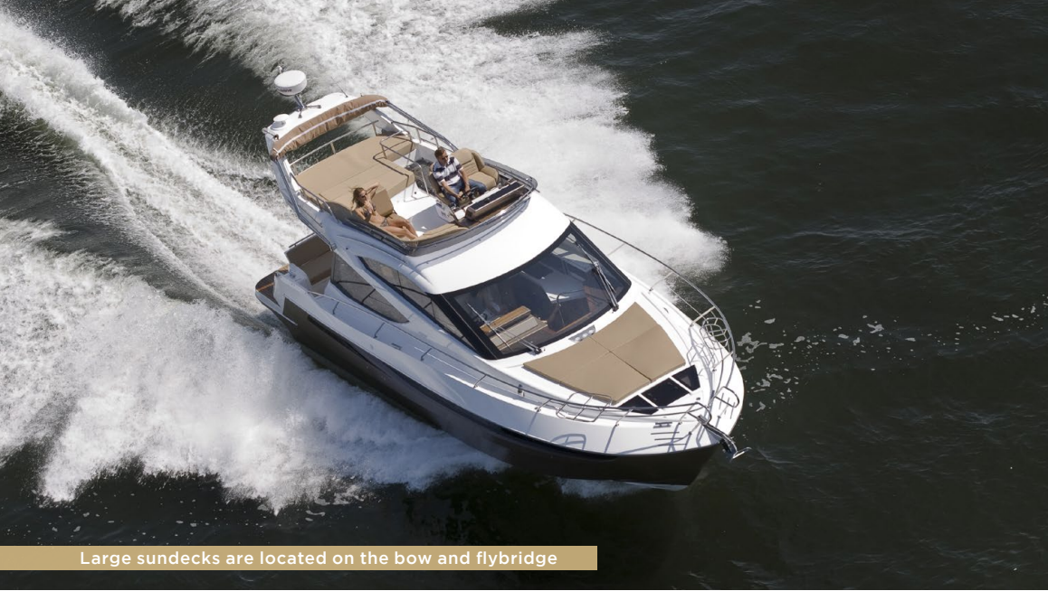
Large sundecks are located on the bow and flybridge