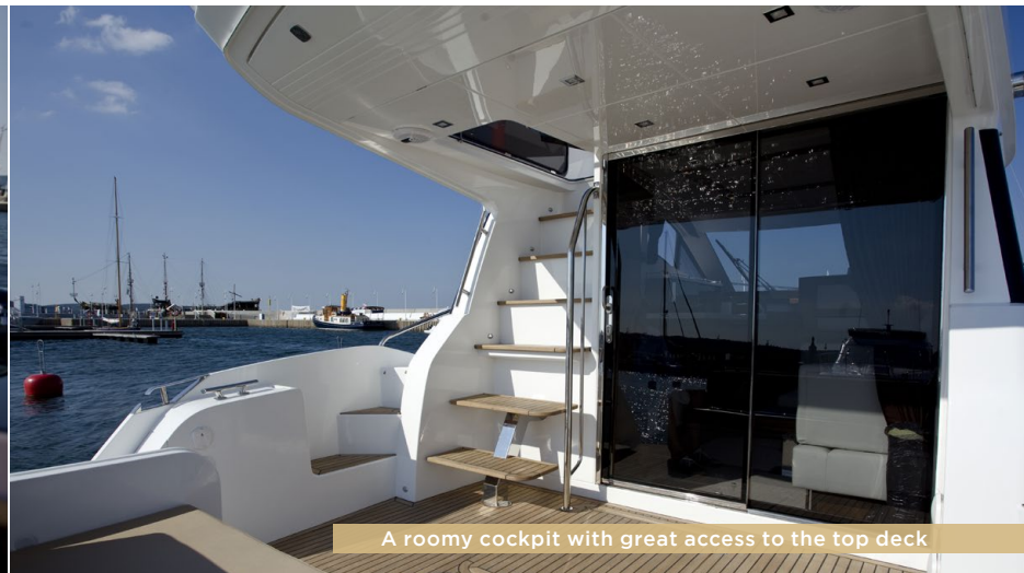
A roomy cockpit with great access to the top deck

The 380 FLY is a third-generation Galeon yacht with a distinctive line sharing similarities with the bigger models yet remaining fresh and recognizable.