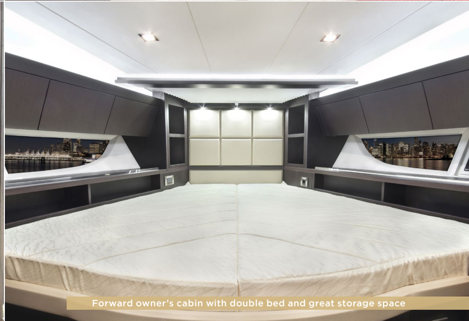
Forward owner's cabin with double bed and great storage space