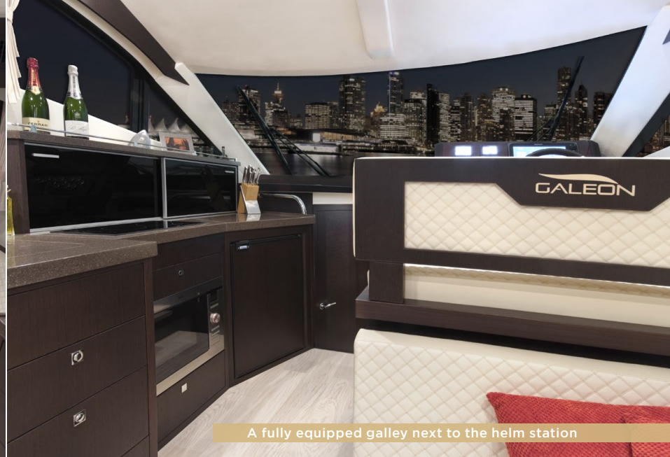
A fully equipped galley next to the helm station