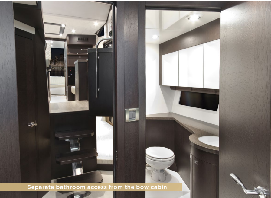
Separate bathroom access from the bow cabin