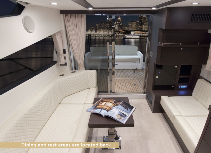
Dining and rest areas are located back