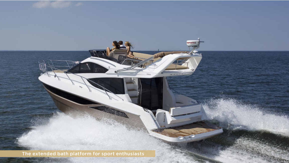
The extended bath platform for sport enthusiasts

The main deck features a comfortable dinette, a helmsman's station and a galley that can be moved down below in the two-cabin version. A plethora of interior design options with a choice of high-quality natural woods allow you to fully customize the yacht to suit your needs. Below deck, find up to three cabins. The separated shower cabin and toilet ensure comfort and privacy. The bow owner's cabin is well lit, thanks to the skylight with an integrated hatch. It offers numerous storage compartments. Exceptional design, pure comfort and ultimate convenience – the 380 FLY has it all.